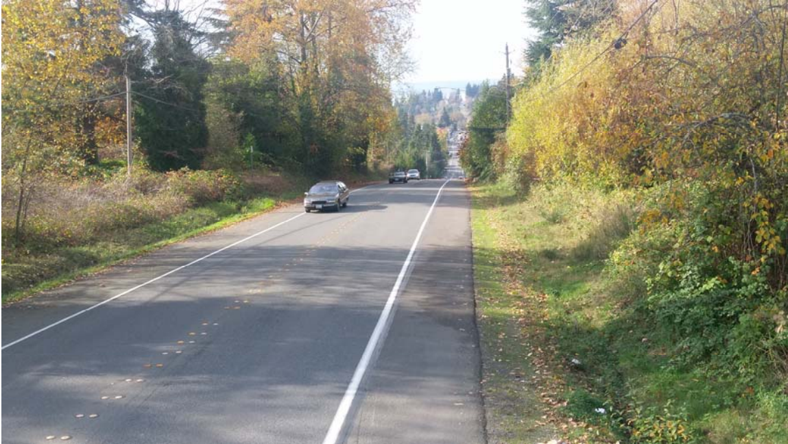
Westerly view of S. 216 th Street from 18 th Avenue S (Open ditch)

The City of Des Moines is pleased to announce that this link of South 216 th Street, Segment 3 is nearing the construction phase. This critical phase of the Transportation Gateway Project completes a multimodal gateway for the City, linking Pacific Highway S. to the downtown Marina District.